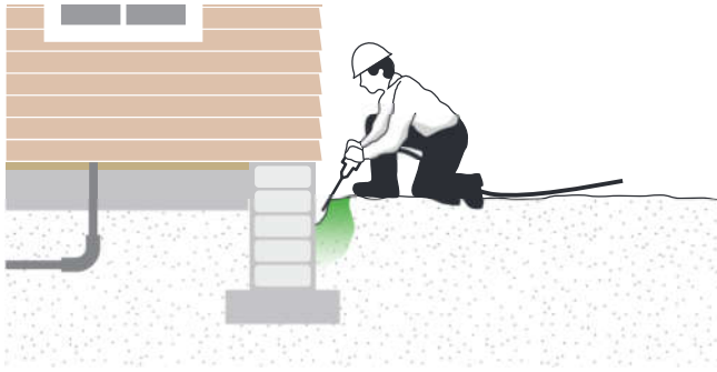
Altriset (shown in green) is applied in a trench around the foundation of a home.

Your termite professional will apply Altriset in a six-inch deep trench dug around the perimeter of your home. After this is covered with dirt, there will be no visible sign of treatment. Areas where concrete slabs are present, such as garages, porches and basements, require drilling so the ground is accessible.