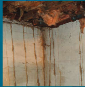
Mud tubes along the concrete wall of this damp basement allow termites to travel into the home above.